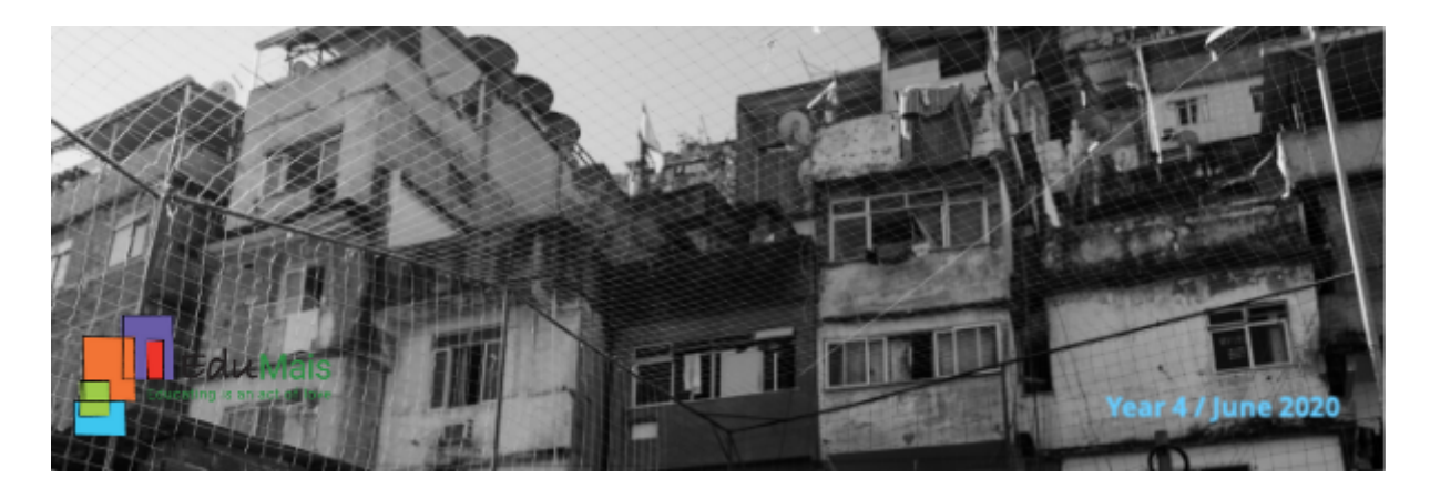
One family Their struggle Your impact