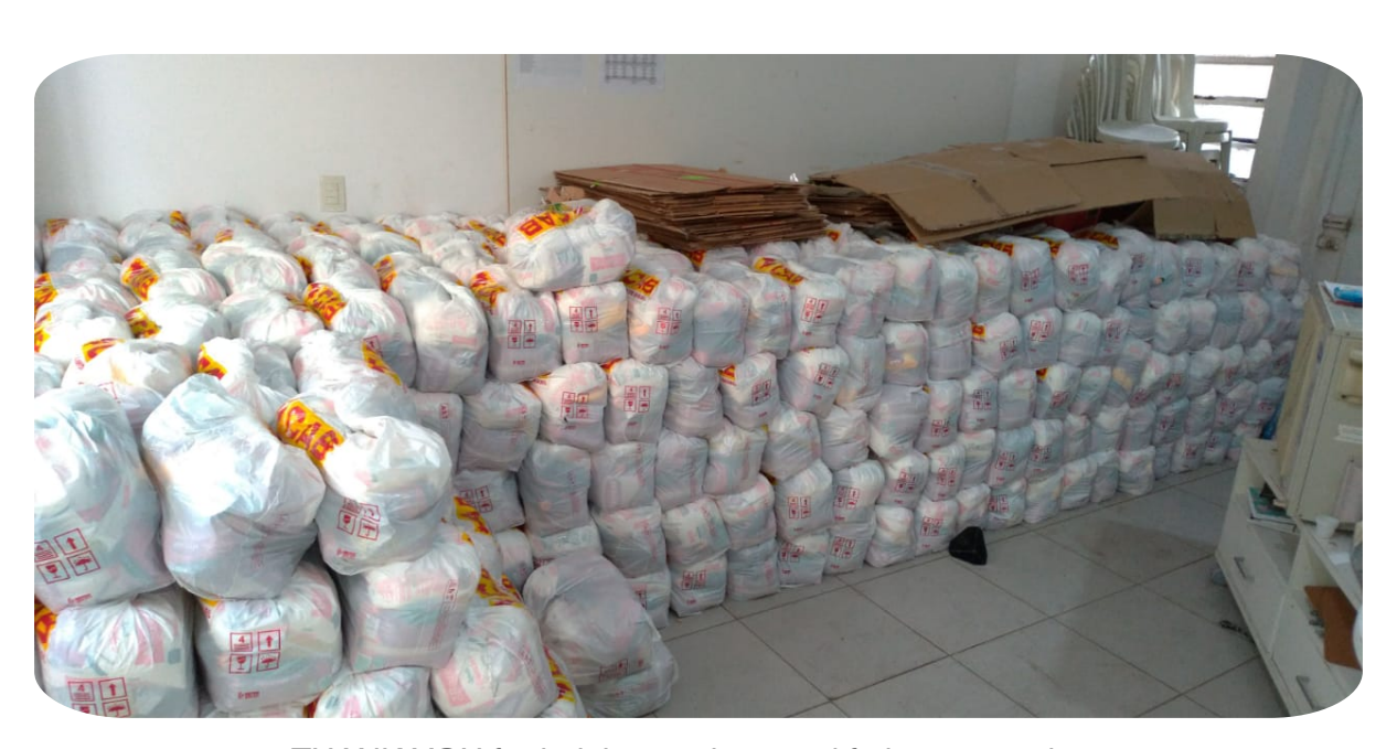
THANK YOU for helping mothers and fathers worry less.

THANK YOU for helping families get to tomorrow.